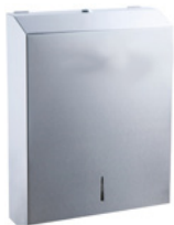
PTDSS1 Paper Towel Dispenser