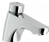
AM071 Time Flow Basin Tap