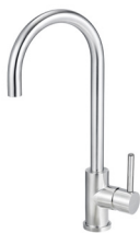
Goose Neck Mixer Stainless - AM021