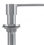
Lotion Dispenser Stainless - AL041